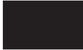
46. Lacquered - Black

*Other colors: according to customer samples, on request