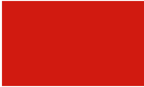
44. Lacquered - Red